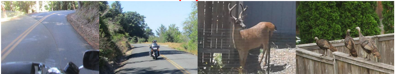
[ Carpenterville Highway, 20JUL21/ ditto / deer in yard, 22JUL21 / turkeys in yard, 13AUG21 ]

The attached over sized 2 car garage came with cabinets with a sink, washer, dryer and a workbench on the back wall and built in cabinets on 2 sides, the near side cabinets got riding gear and dog stuff, the far side got all the Christmas decorations. We put the 6' tall tool chest on the back wall, freezer on the near side, refer on the far side and still had plenty of room for the Geo, the Solara and two of the Harleys. Furniture was brought into the house; boxes of household "stuff" packed in and around furniture were just stacked in the house, AND STILL the sea container is only about 80% emptied. After 3 days in a row of sun we were ready to take a break while it rained and deal with what all we moved/stacked into the house... we prayed for rain often.