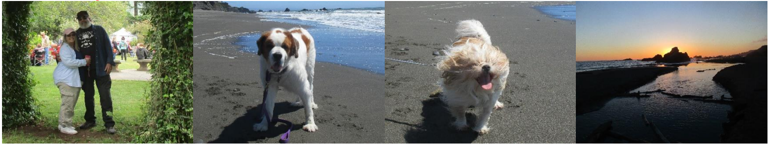
[ Azealia Gardens car show 29MAY21 / Penny & LucyHarbor beach 06JUN21 / Harris Beach sunset ]

2021 begins with us still living in "camping mode" with minimalistic things in the house that we brought from California and, the arrival of our 40 foot long sea container on New Years Day!... in the rain! November and December had been rain free for the most part but not so now as we began unloading the sea container on sunny days. Rocks, yes, boxes and boxes of rocks of course we temporarily emptied on to the driveway. Yard tools, camping gear, bench press machine plus weights, camping equipment, vacuums, some furniture and more went into the detached one car garage. Bar-B-Que grill, chase lounges and patio furniture went onto the deck and the reloading bench and flip-top totes of garage "stuff" stayed in the sea container.