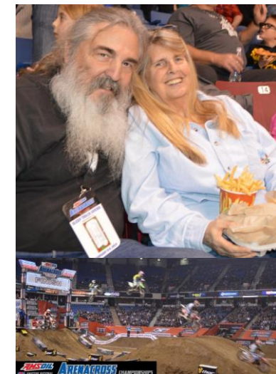
February: Extreme Motorcycle Supercross