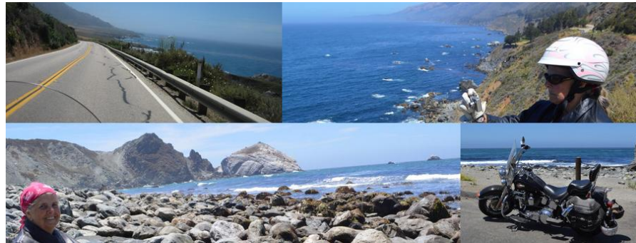
Big Sur, south of Monterey, camping with family & friends and riding the Pacific Coast Highway