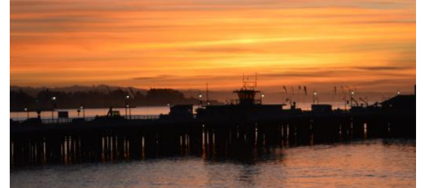
October: Anniversary celebration at the Dream Inn Hotel in Santa Cruz