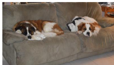
Izzy and Penny at home on the couch