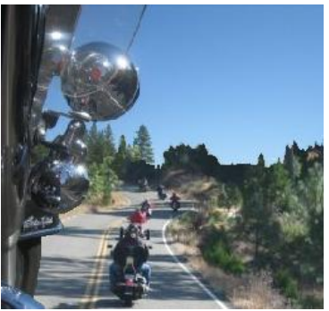
SEP: E Clampus Vitus Poker Run