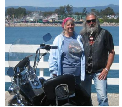
Santa Cruz JUN: