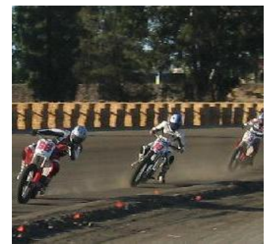
JUL: Sacramento Mile