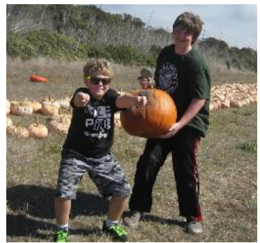
OCT: Davenport Pumpkin Run