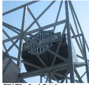
JUN/JUL: Road Trip!