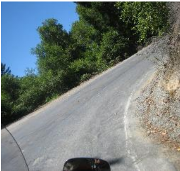
JUN: Santa Cruz Mtns