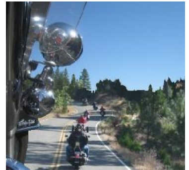
SEP: E Clampus Vitus Poker Run

Rusl continues contributing articles, photos and selling advertising for Thunder Roads Magazine NorCal and is webmaster for not-for-profit organizations and several small businesses.