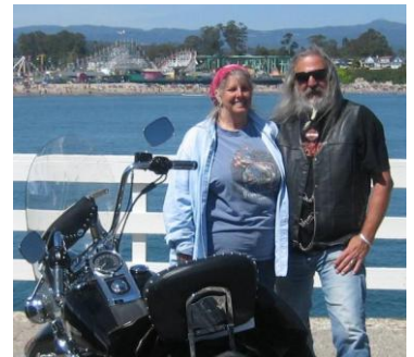
JUN: Santa Cruz