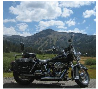
AUG: Cutthroat Saloon

We welcomed in the new year with a ride with Dudley Perkins Harley-Davidson over to the coast - started out with fog in West Sac (couldn't go over 40mph on the freeway), but as we got to Vallejo it was sunny and almost too warm on the coast highway (78°). Throughout spring and summer we were able to ride and camp with friends and fellow "biker trash." Of course, some of the trips were business covering events for Thunder Roads Magazine NorCal, such as press passes for the Redwood Run and the Sacramento Mile. We camped in Pescadero, north of Santa Cruz, and rode all the roads we rode together back in 1966/67 bringing back lots of fond memories and we were able to share those great roads with 16 friends on that trip. Love California riding!