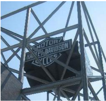
JUN/JUL: ROAD TRIP!

We welcomed in the new year with a ride with Dudley Perkins Harley-Davidson over to the coast - started out with fog in West Sac (couldn't go over 40mph on the freeway), but as we got to Vallejo it was sunny and almost too warm on the coast highway (78°). Throughout spring and summer we were able to ride and camp with friends and fellow "biker trash." Of course, some of the trips were business covering events for Thunder Roads Magazine NorCal, such as press passes for the Redwood Run and the Sacramento Mile. We camped in Pescadero, north of Santa Cruz, and rode all the roads we rode together back in 1966/67 bringing back lots of fond memories and we were able to share those great roads with 16 friends on that trip. Love California riding!