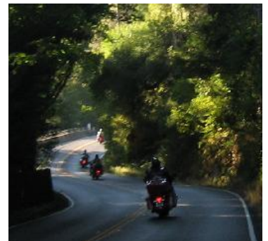
SEP: Volpi's Ristorante