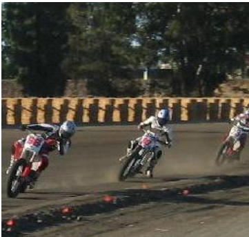
JUL: Sacramento Mile